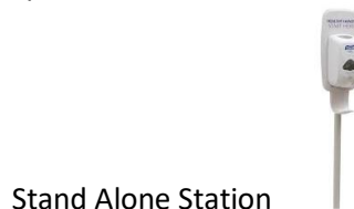
Stand Alone Station