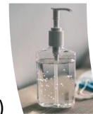
Hand Sanitizing Bottles (Easy to place all over)